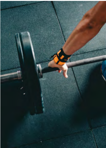
PLANET FITNESS 12-MINUTE WALK

Grab a racquet and have a hit in a social, welcoming club home to casual games, serious competition, or a space to get out and enjoy the fresh air with some friends.