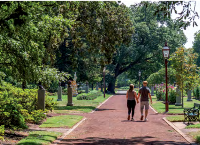
Ballarat Botanical Gardens