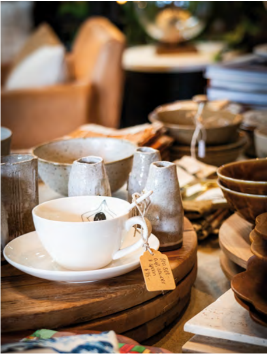
Ballarat Central Retail