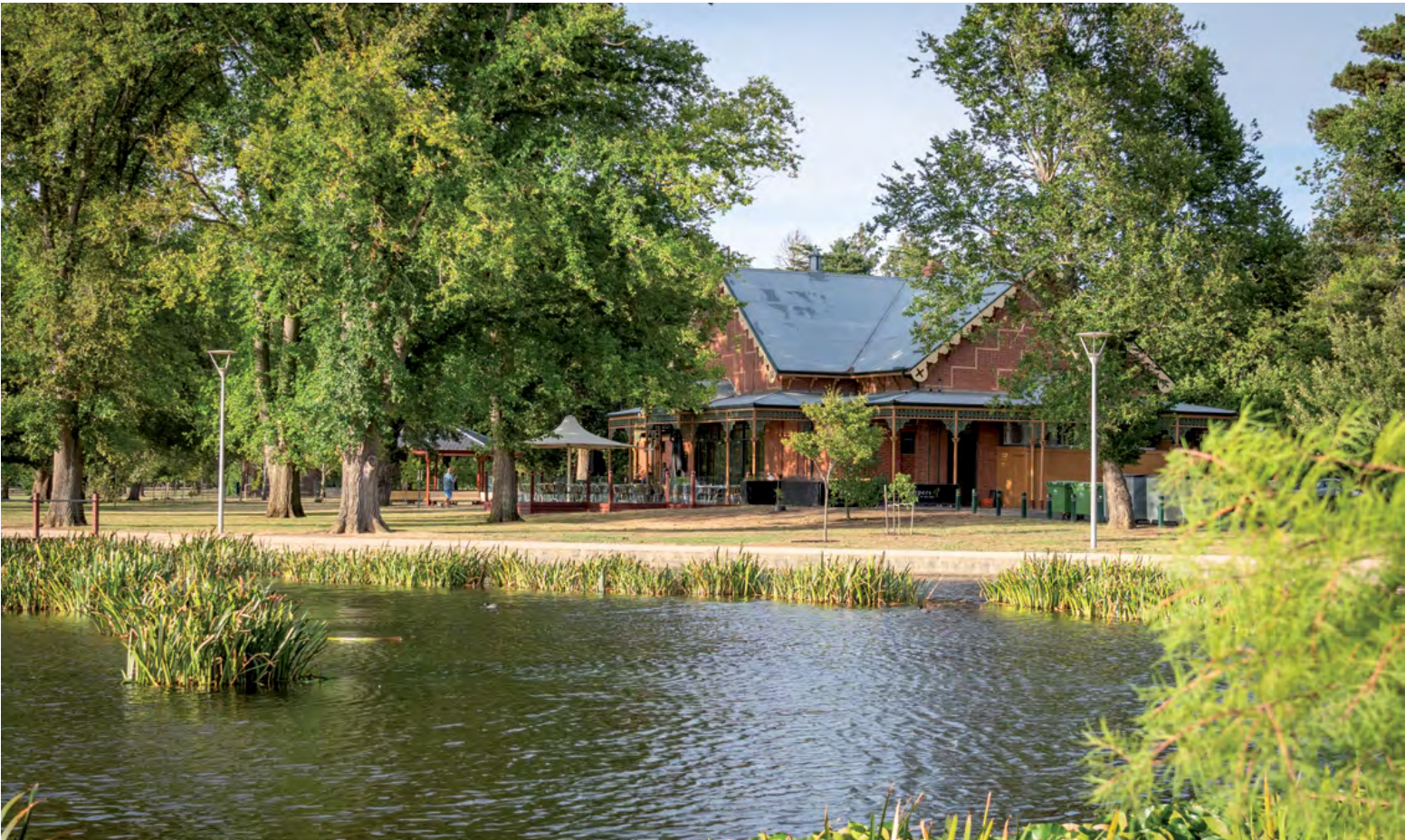
Lake Wendouree Reserve