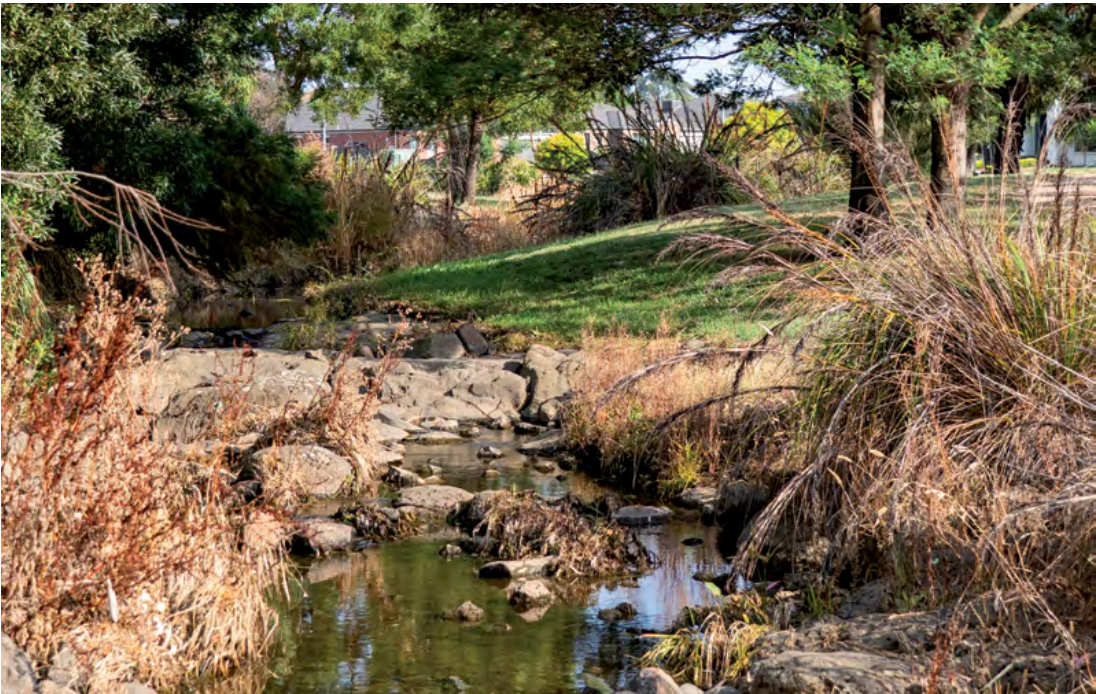
BONSHAW CREEK 2-MINUTE WALK

Life’s best when everything is easy. Schools, cafés, work, fitness, and green spaces, Bonshaw has it all, just minutes from home.