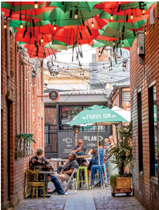
Ballarat Umbrella Laneway

Down by Lake Wendouree, joggers and cyclists weave past families feeding the ducks, and the Ballarat Botanical Gardens stand tall with stories of the past. Art, history, and a love for the good things in life run through this town’s veins. Whether it’s a live gig in a hidden laneway or a lazy afternoon picnic under 100-year-old canopies of leaves, Ballarat feels like a place that knows how to live well.