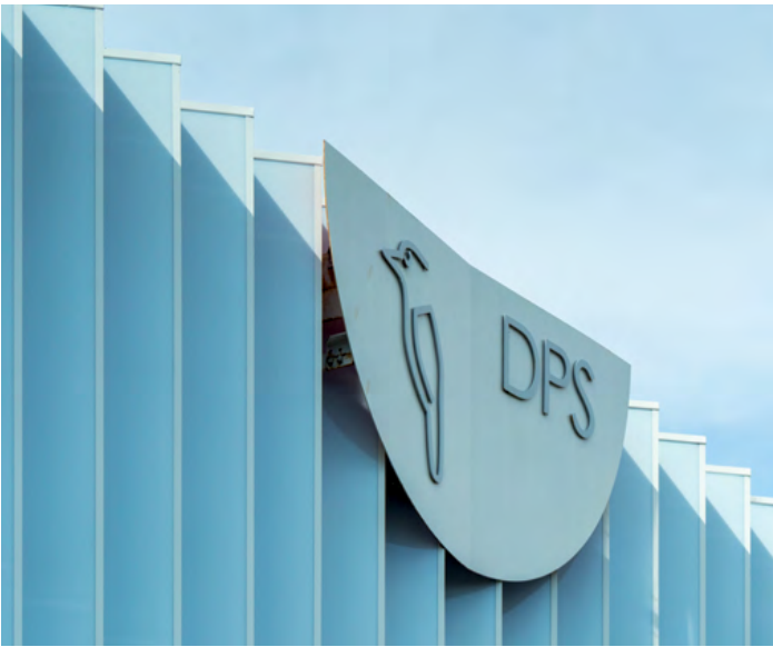
DELACOMBE PRIMARY SCHOOL 10-MINUTE WALK

A peaceful little pocket of nature, just a stone’s throw from home. Morning strolls, evening jogs, and weekend picnics under the gum trees, this is where fresh air and slow moments come together beautifully. And, it’s all in your backyard at Floriana.