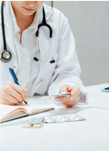
DELACOMBE MEDICAL CENTRE 10-MINUTE WALK

No-judgment workouts in a friendly, welcoming space is what Planet Fitness is all about. From strength and cardio to a quick stretch to clear the mind, Planet Fitness makes staying active easy and enjoyable.