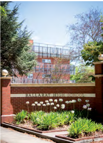
BALLARAT HIGH SCHOOL 20-MINUTE WALK

A nurturing space where tiny hands and big imaginations flourish. Play-based learning, caring educators, and plenty of giggles, Kidscape is everything a great start to life should be. Bonshaw families love Kidscape for its friendly atmosphere and easy transition into primary school.