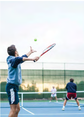
TENNIS BALLARAT 15-MINUTE WALK

A respected secondary school with a reputation for academic success, sporting excellence, and strong leadership programs, Ballarat High School prepares students for a bright future while keeping them grounded in a supportive community.