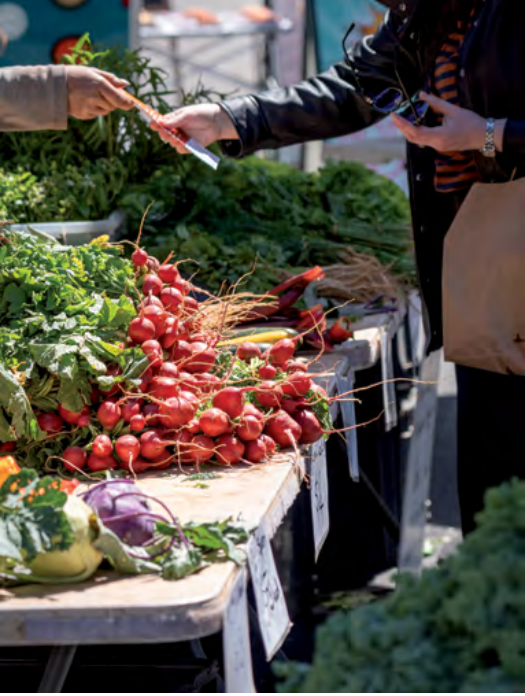
Ballarat Farmers Market