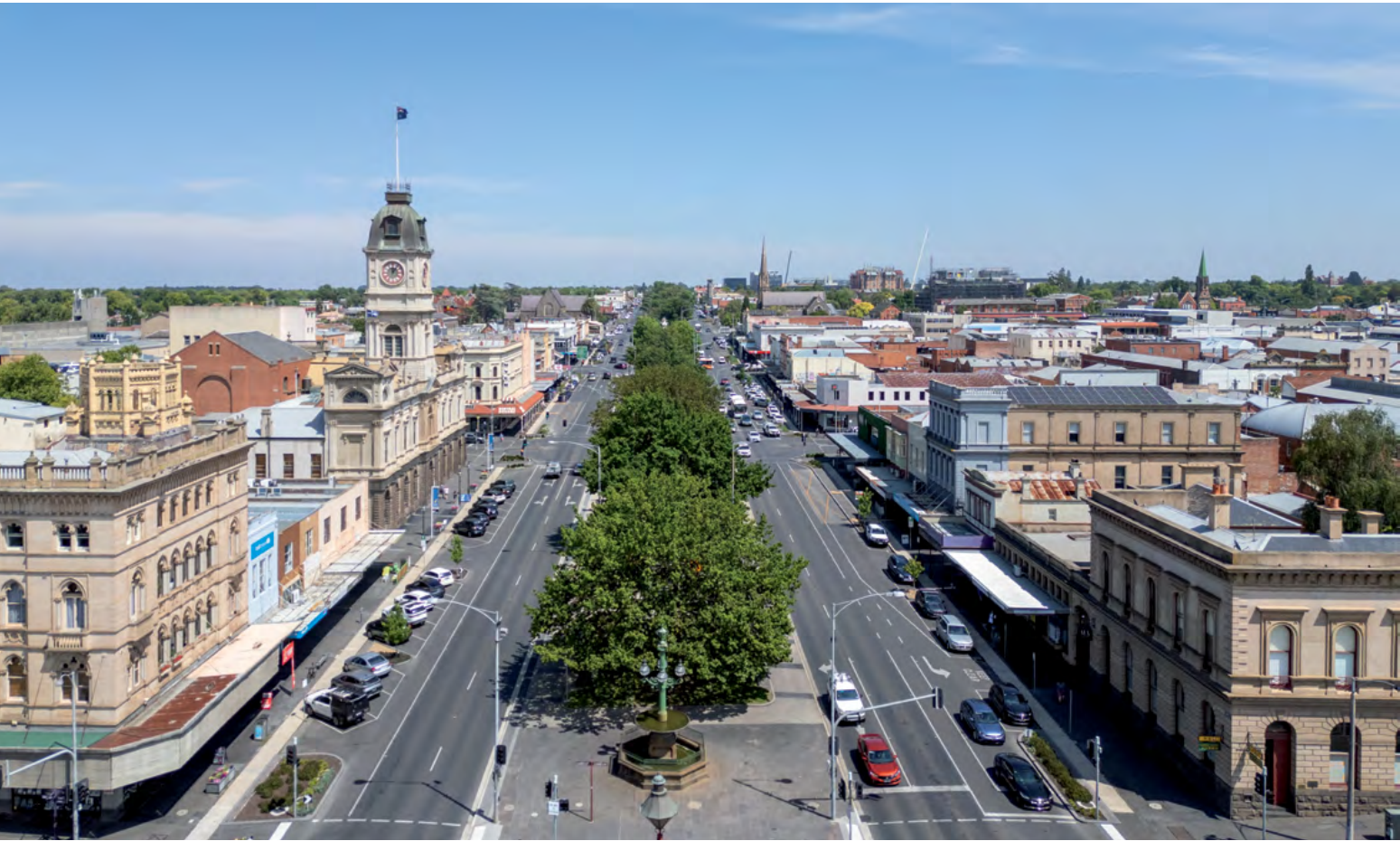
Sturt St, Ballarat