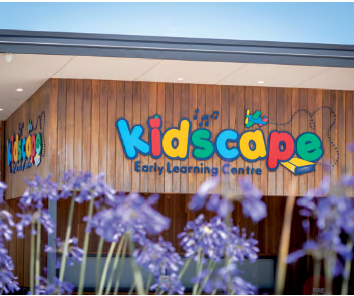
KIDSCAPE EARLY LEARNING 8-MINUTE WALK

A warm, welcoming school with a strong community spirit. Small enough that teachers know every student’s name, but big on opportunity, with excellent learning programs, sports, and arts. Kids at Delacombe Primary School thrive, make lifelong friends, and feel equipped to succeed in whatever it is they love.