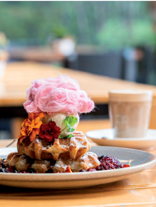
The Turret Cafe

For those who love a long lunch, Wayward Winery offers good company, rolling vineyard views, and a glass of something special. Weekends bring art exhibitions, live music, and community festivals that keep the city’s creative energy alive. From vibrant streets to peaceful escapes, Ballarat is a place where every day has something fresh to offer.